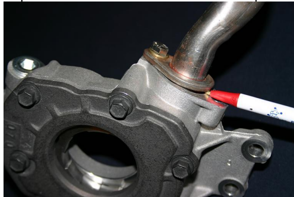
(This pickup tube is NOT installed correct)

Step 2: Remove oil pump pickup tube and Windage tray, make sure the original oil pump pickup tube o-ring is removed. Install the new Windage tray and fasteners placing a drop of blue Loctite on the threads. Torque the fasteners to 106 in/lbs. Install the new pickup tube (and girdle if you ordered on with your oil pan), make sure that the pickup tube is installed correctly into the oil pump housing. Place a drop of blue Loctite on the threads and torque the fasteners to 106 in/lbs.