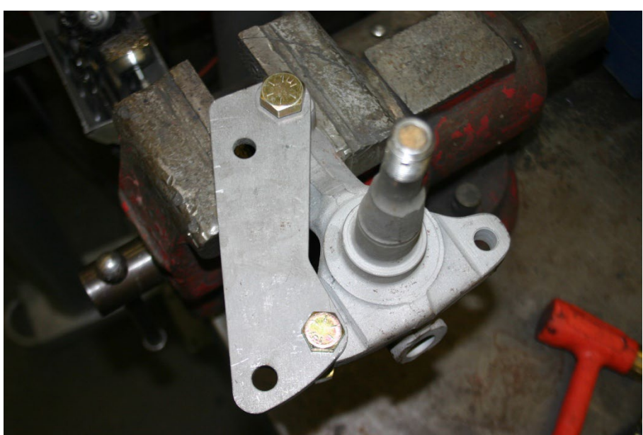
You will need to use the supplied ½" x 3" bolt in the rear steering arm bolt hole as the extra thickness of the bracket will make the factory one to short.