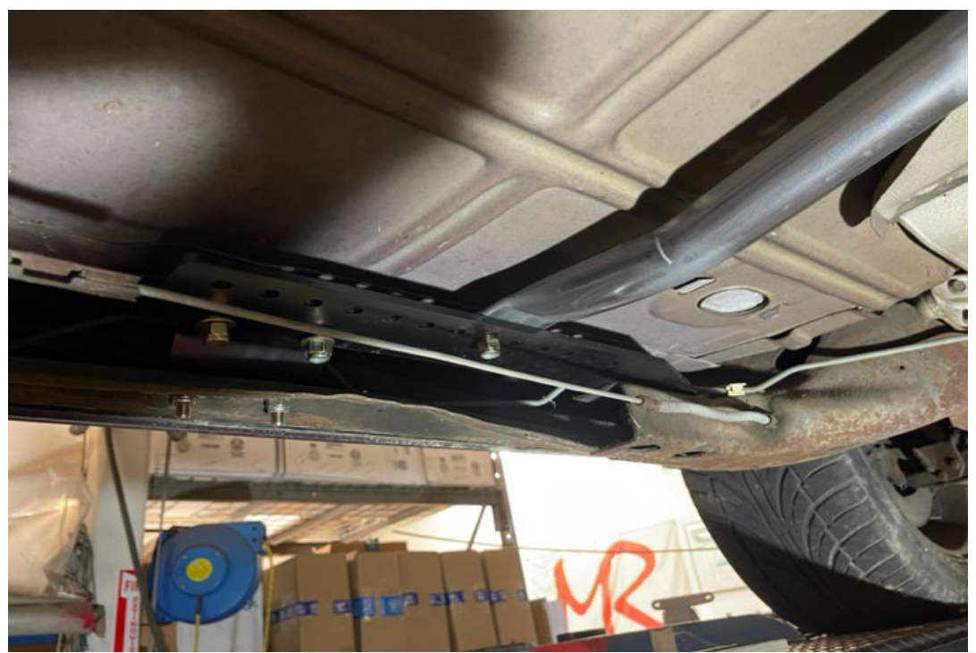
Driver side bracket mounts to the chassis with the tapered end facing the front of the car as shown

Install the driver and passenger side Crossmember brackets along with the drivers side rear support "Z" bracket as shown in the photos.