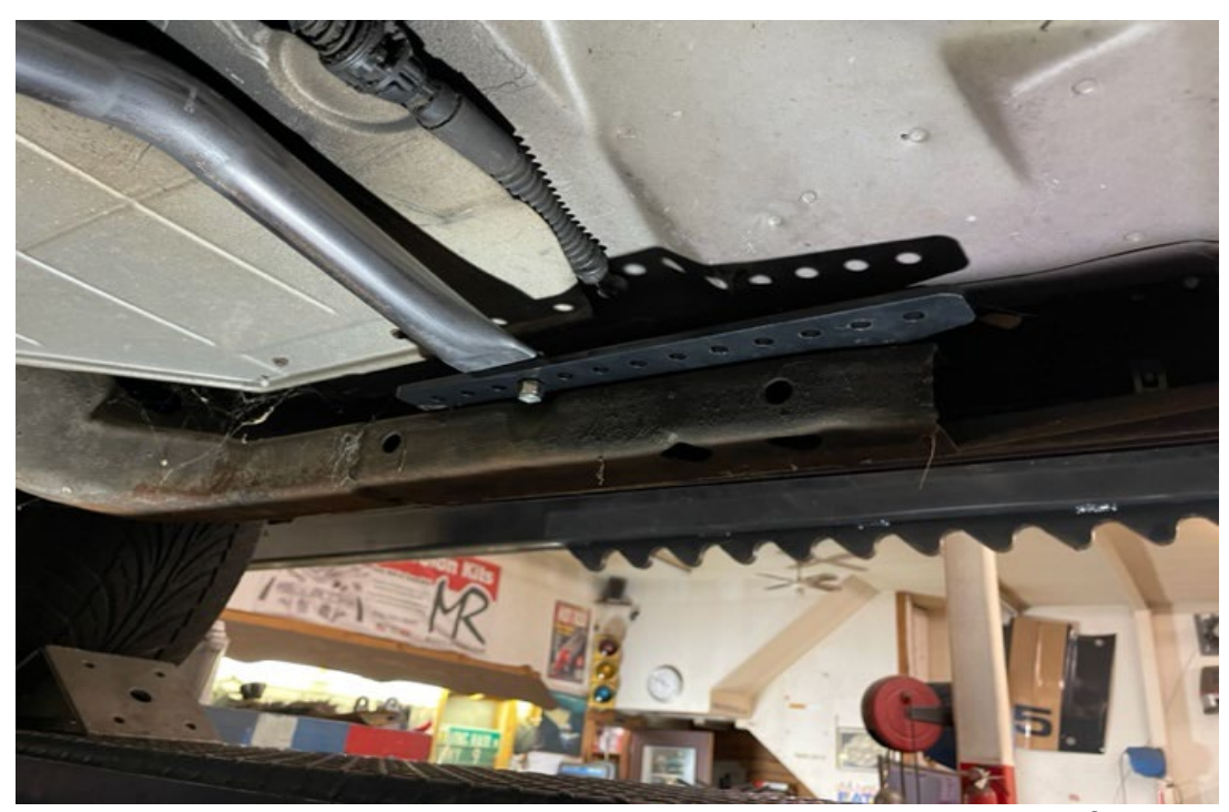
The passenger side bracket bolts to the chassis with the tapered end facing the rear of the car as shown