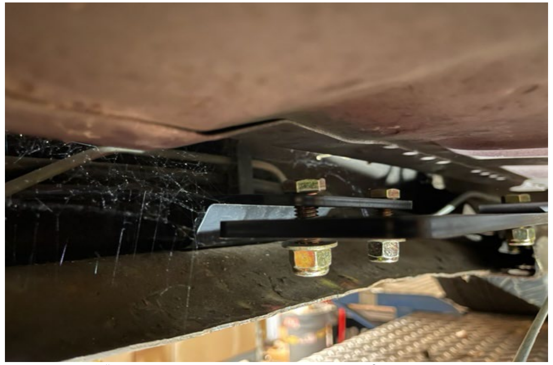
The additional "Z" bracket supports the rear portion of the driver side bracket. It bolts to the inside of the chassis and the top of the long bracket as shown