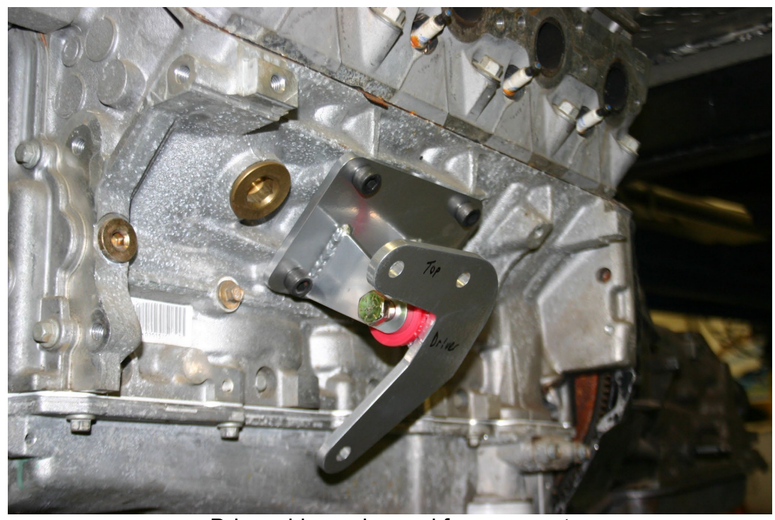
Driver side engine and frame mount

Locate the Driver's Side (LEFT) and Passenger's Side (RIGHT) motor mounts and loosely bolt them to the engine using the supplied 10mm allen head bolts, now loosely bolt the frame brackets to the engine mounts using the supplied \frac{1}{2} "-13 x 4" long bolts and nylon lock nuts. (The bolts will be tightened after the engine is set in place and everything is lined-up)