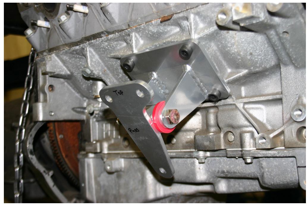
Passenger side engine and frame mount

Install the driver and passenger side Crossmember brackets along with the drivers side rear support "Z" bracket as shown in the photos.