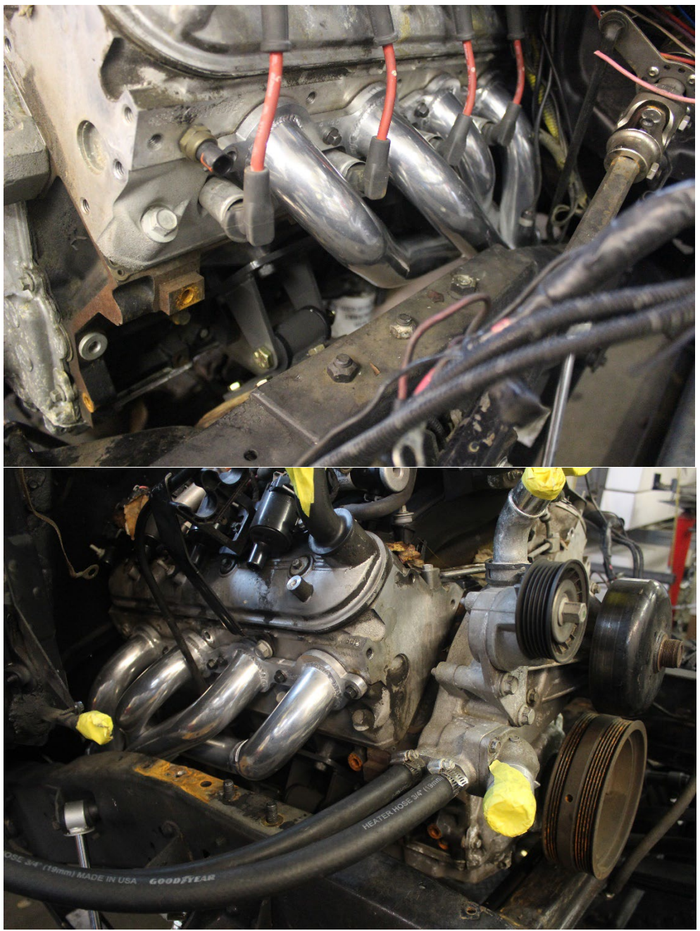
The Muscle Rod line of headers from Husler is designed to bolt in with this kit for an easy bolt in install with great performance and fitment.

Road test your vehicle to familiarize yourself with its new handling characteristics. BRP cannot supervise your installation of these parts and systems cannot be held responsible more than the cost of the kit and/or parts. The vehicle should be operated normally. Contact BRP if you need anything or if we can be of assistance. (Check the BRP web site for additional help).