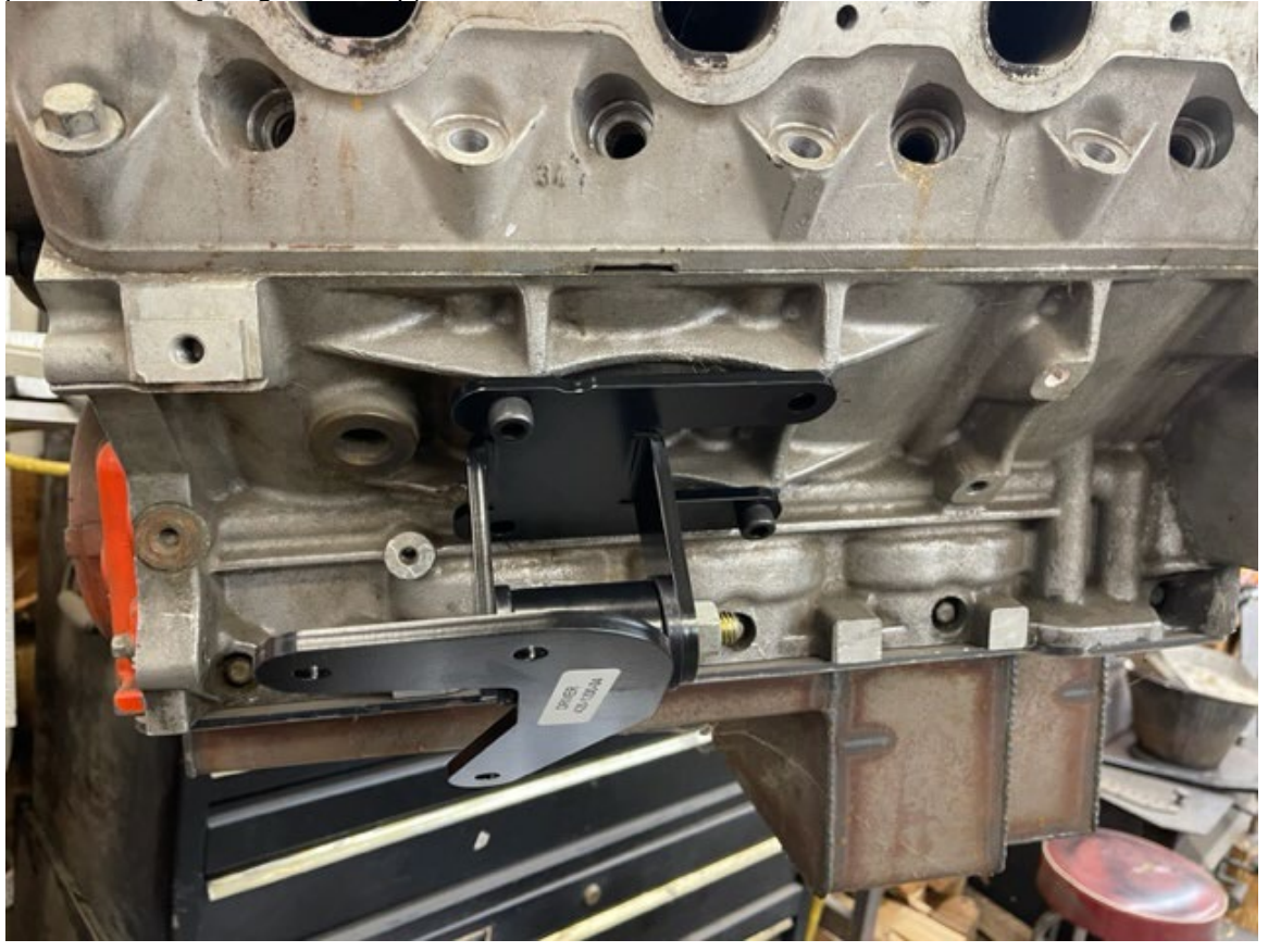
Detailed view of driver's side engine mount and frame bracket on engine

Locate the Driver's Side (LEFT) and Passenger's Side (RIGHT) motor mounts and loosely bolt them to the engine using the supplied 10mm allen head bolts, now loosely bolt the Driver's Side (LEFT) and Passenger's Side (RIGHT) frame brackets to the engine mounts using the supplied 1/2"-13 x 4" long bolts and nylon lock nuts. (The bolts will be tightened after the engine is set in place and everything is lined-up)