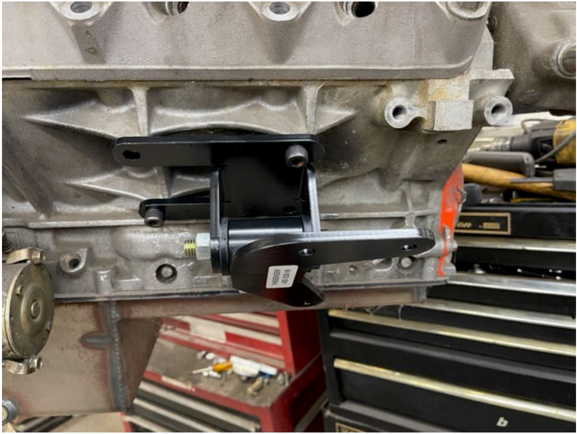
Detailed view of passenger's side motor mount and frame bracket on engine

Lower the engine into the chassis and align the frame bracket to frame bolt holes and loosely install the 3/8-16 \times 1^{\circ} bolts, flat washers and nylon lock nuts.