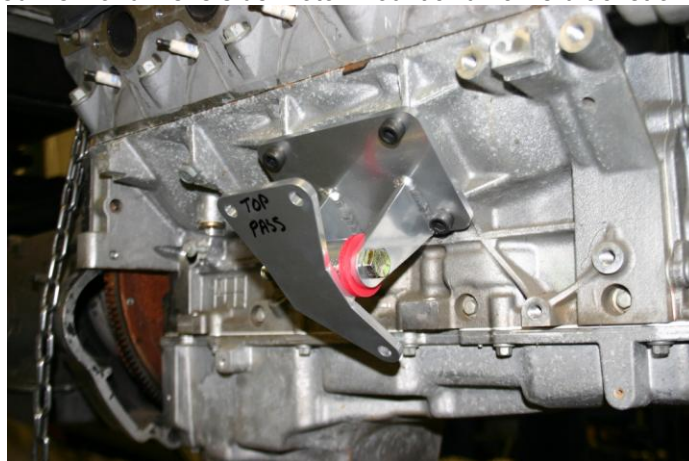
(Detailed view of passenger's side motor mount and frame bracket on engine)