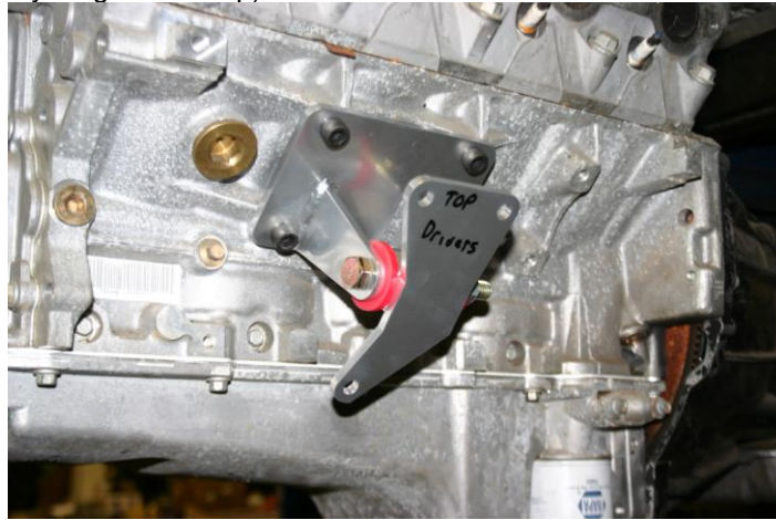
(Detailed view of driver's side motor mount and frame bracket on engine)

Step 1: Locate the Driver's Side (LEFT) and Passenger's Side (RIGHT) motor mounts and loosely bolt them to the engine using the supplied 10mm allen head bolts, now loosely bolt the Driver's Side (LEFT) and Passenger's Side (RIGHT) frame brackets to the engine mounts using the supplied ½"-13 x 4" long bolts and nylon lock nuts. (The bolts will be tightened after the engine is set in place and everything is lined-up)