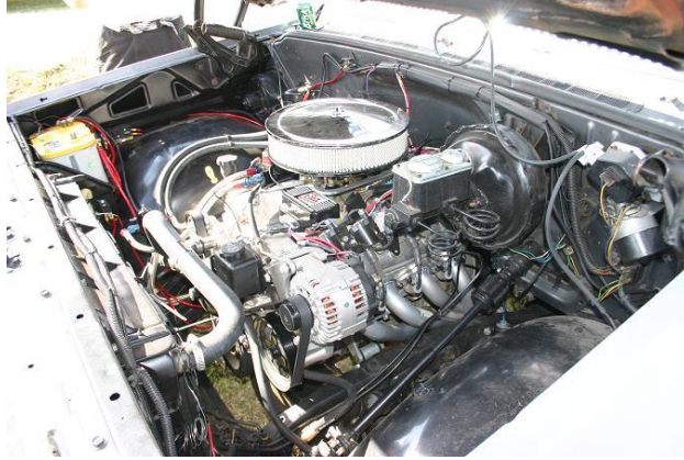
(Carbureted LSx engine in 73-87 GMC truck)