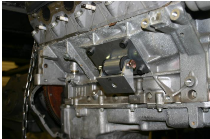
(Detailed view of passenger's side motor mount and frame bracket on engine)