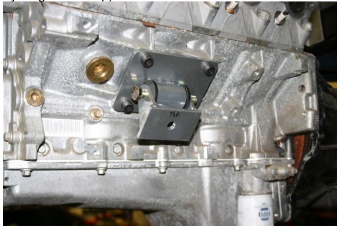
(Detailed view of driver's side motor mount and frame bracket on engine)

Step 1: Locate the Driver's Side (LEFT) and Passenger's Side (RIGHT) motor mounts and loosely bolt them to the engine using the supplied 10mm allen head bolts, now loosely bolt the Driver's Side (LEFT) and Passenger's Side (RIGHT) frame brackets to the engine mounts using the supplied ½"-13 x 4" long bolts and nylon lock nuts. (The bolts will tightened after the engine is set in place and everything is lined-up)