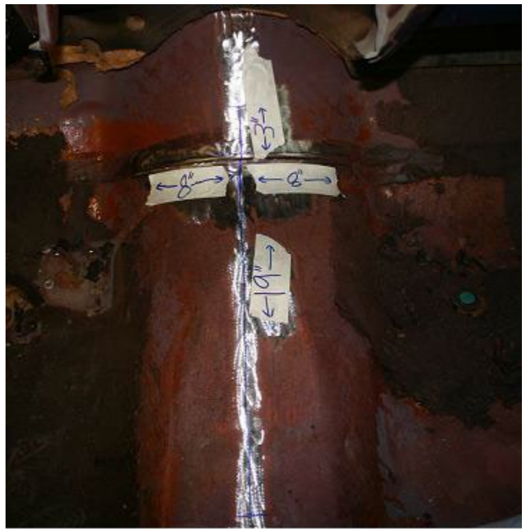
Step 1: If you are installing a T-56 transmission you will need to modify the transmission tunnel. The 4L60E (700R4) require little or no transmission tunnel modifications. The completed transmission tunnel modifications fit under the stock carpet. The first cut will be made straight down the top of tunnel starting at the seam and extending back approximately 19"-20", then forward from the seam approximately 3". The second cut will follow the seam and extends 8" in both directions from the first cut. Using your hands (with gloves on), pliers or a hammer open the transmission tunnel enough to clear the transmission (we suggest fitting the engine and transmission prior to fabricating a patch panel and welding it in place). Once you have test fit your engine and transmission you will need to fabricate a patch panel to fill the opening leftover from splitting the transmission tunnel. We suggest welding the patch panel in place, however you can pop-rivet it in place and use seam sealer to seal it. (NOTE: there is a factory casting tab that sticks out on the top driver's side of the T-56 that needs to be cut off with a cut off wheel to help in tunnel clearance. It is located between the Trans bolts).