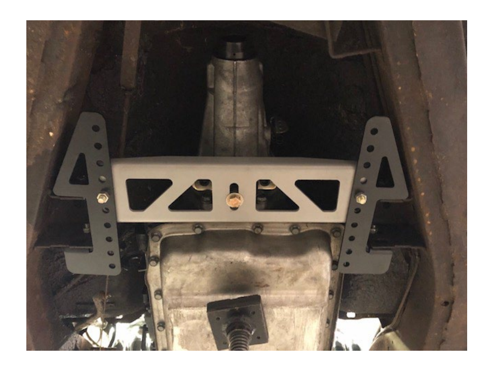
Step 3: Using a jack lift the transmission into position to install the transmission crossmember. Start by bolting the transmission mount and spacers provided to the transmission, make sure you install the gold preload plate directly on top of the transmission mount. Loosely bolt the frame brackets to the frame using the provided 3/8"-16 \times 1" long bolts, washers and nylon lock nuts. Slide the transmission crossmember into position and install using the provided 3/8"-16 \times 1" long bolts, washers and nylon lock nuts. Using the 7/16"-13 \times 1" bolt and flat washer bolt the transmission mount to the crossmember.

Now that all of the bolts are started and the engine is installed go back and tighten all of the bolts. After the first test-drive re-check all bolts.