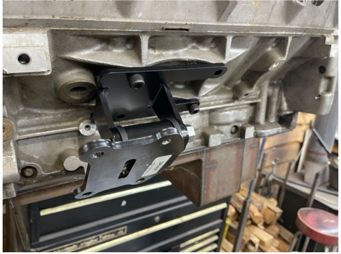
Detailed view of driver's side engine mount and frame bracket on engine

Locate the Driver's Side (LEFT) and Passenger's Side (RIGHT) motor mounts and loosely bolt them to the engine using the supplied 10mm allen head bolts, now loosely bolt the Driver's Side (LEFT) and Passenger's Side (RIGHT) frame brackets to the engine mounts using the supplied 1/2"-13 x 4" long bolts and nylon lock nuts. (The bolts will be tightened after the engine is set in place and everything is lined-up)