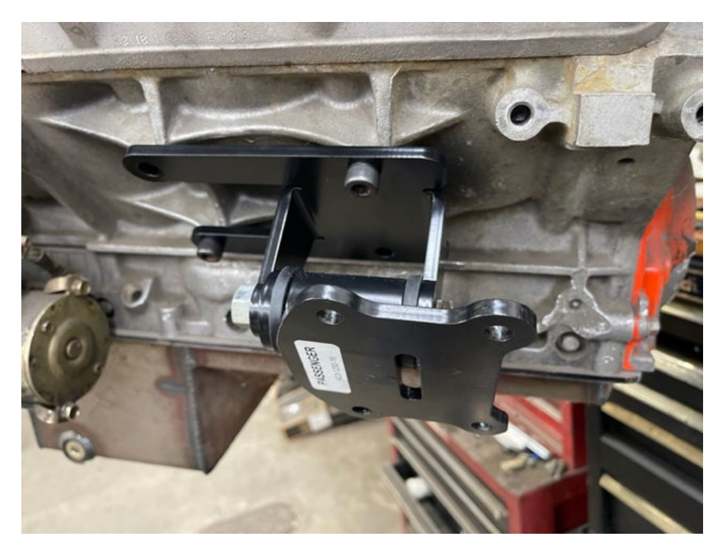
Detailed view of passenger's side motor mount and frame bracket on engine