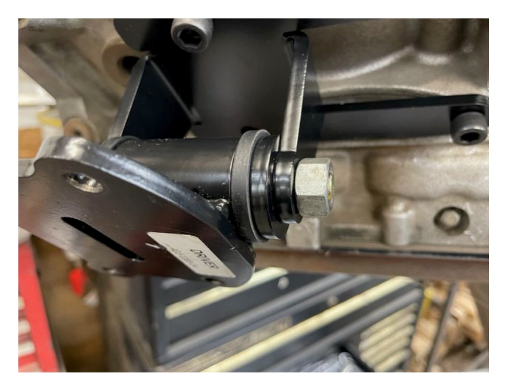
Notice the included ¼" thick washer that goes between the frame mount bushing and engine mount tab. This keeps the Bushing from wanting to push out of the frame mount under high loads.