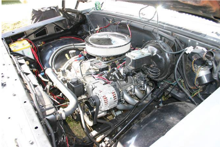
(Carbureted LSx engine in 73-87 GMC truck)

Step 4: Once you have checked to make sure that everything is installed correctly and lined up go back and tighten the engine mount to block bolts, engine mount to frame bracket bolts, frame bracket to frame bolts, transmission mount to transmission bolts, transmission mount to crossmember bolts and transmission crossmember to frame bolts.