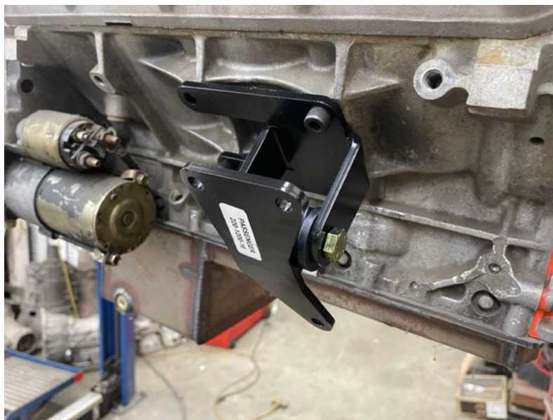
Detailed view of passenger's side motor mount and frame bracket on engine