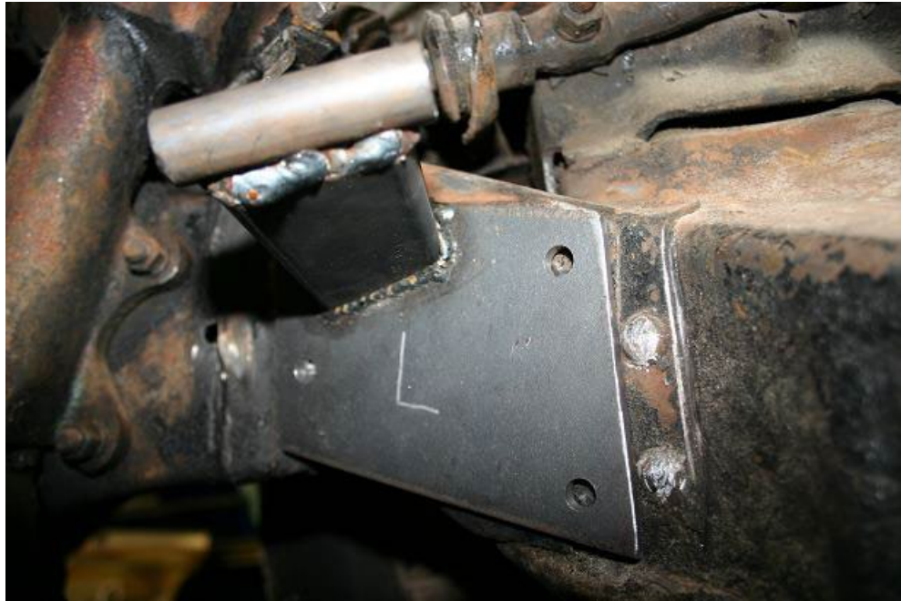
(Detailed view of driver's side frame bracket on the frame)

Step 4: Lower the engine into the chassis and align the frame bracket to frame. The frame brackets should butt-up against the frame rivets. Clamp the frame bracket to the frame and mark the mounting holes on the frame. Remove the engine and drill the holes through the frame.