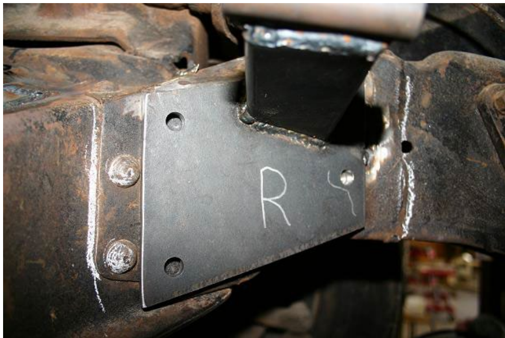
(Detailed view of driver's side frame bracket on the frame)