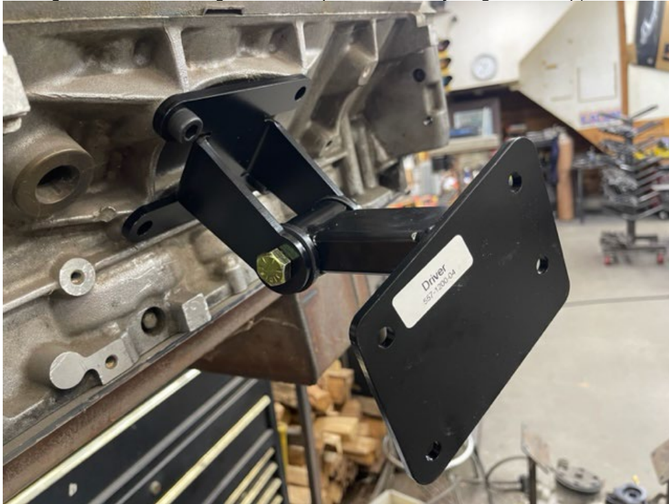
(Detailed view of driver's side motor mount and frame bracket on engine)

Step 3: Locate the motor mounts and loosely bolt them to the engine using the supplied 10mm allen head bolts, now loosely bolt the Driver's Side (LEFT) and Passenger's Side (RIGHT) frame brackets to the engine mounts using the supplied 1/2"-13 x 4" long bolts and nylon lock nuts. (The bolts will be tightened after the engine is set in place and everything is lined-up)