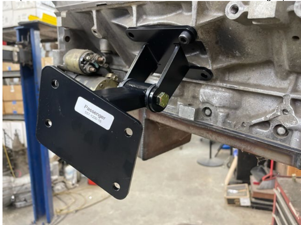
(Detailed view of passenger's side motor mount and frame bracket on engine)