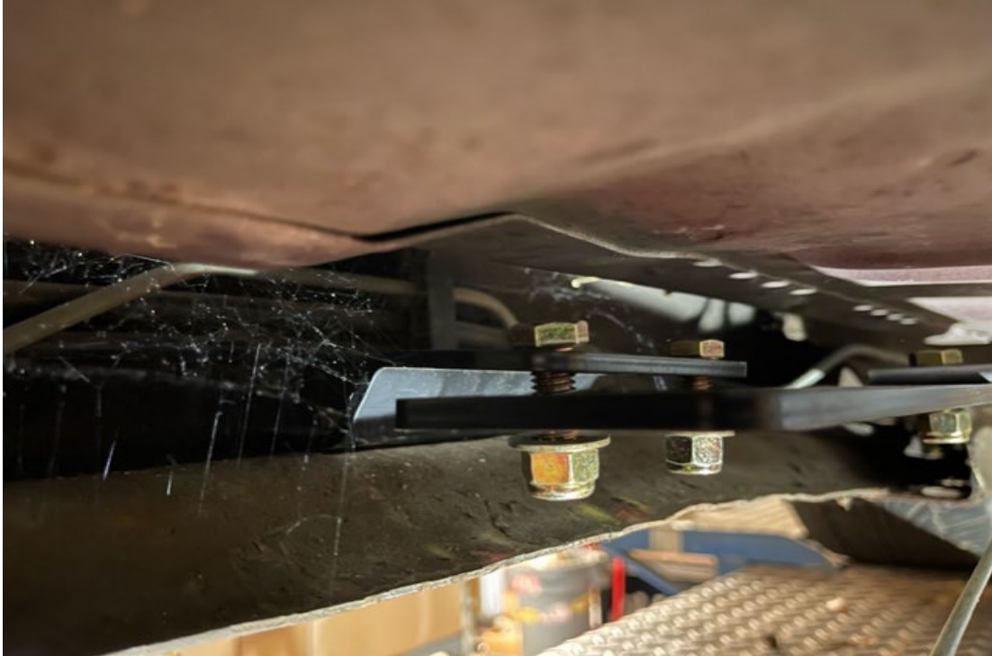
The additional "Z" bracket supports the rear portion of the driver side bracket. It bolts to the inside of the chassis and the top of the long bracket as shown