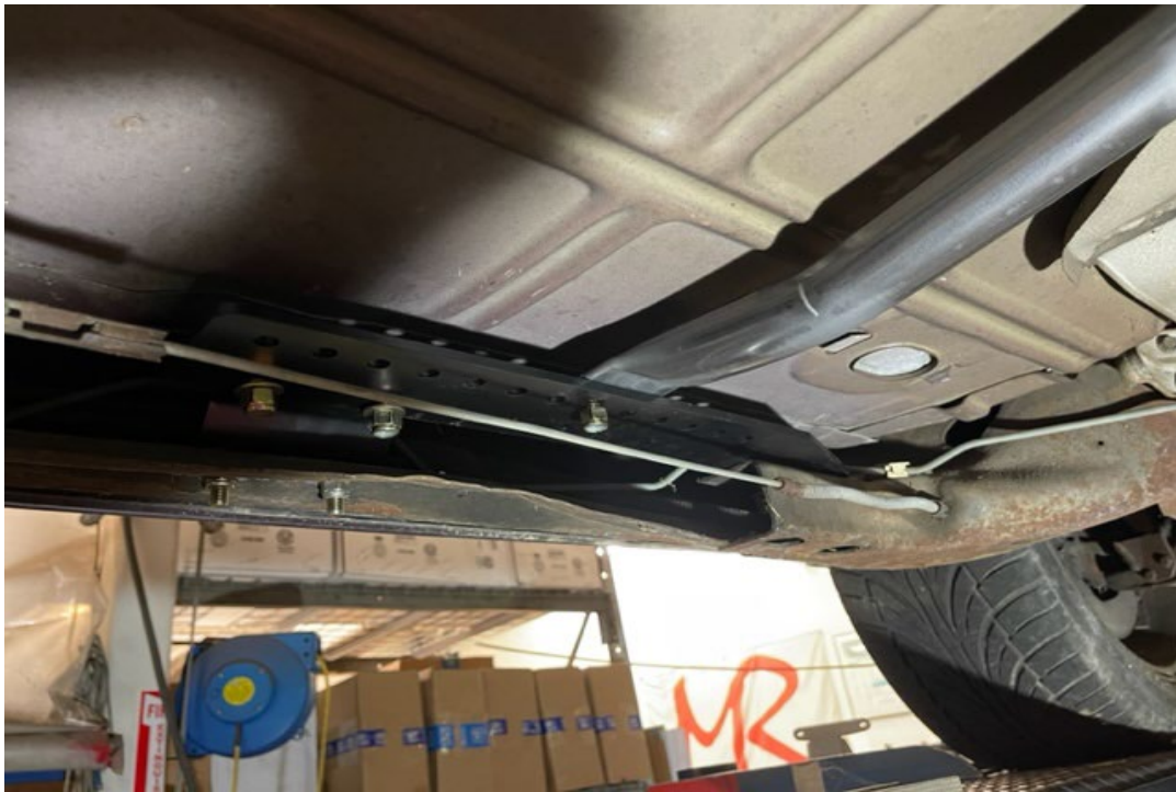
Driver side bracket mounts to the chassis with the tapered end facing the front of the car as shown

Install the driver and passenger side Crossmember brackets along with the drivers side rear support "Z" bracket as shown in the photos.