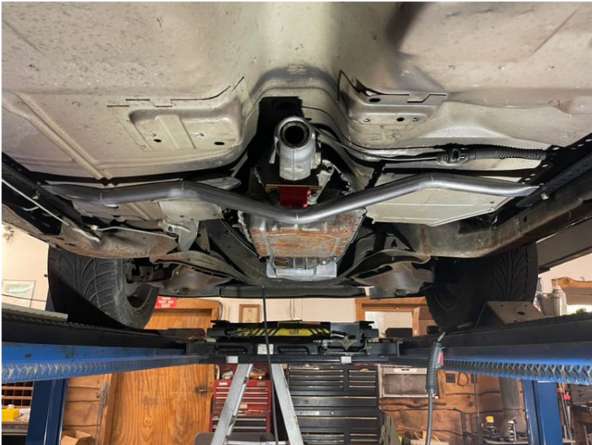
Crossmember installed showing a 4L60E transmission

Lift the rear of the transmission using a floor jack. Install the polyurethane transmission mount on the transmission, making sure that you install the provided gold plate and correct number of spacer shims for your type of transmission between the mount and the transmission (this preloads the polyurethane mount). Slide the transmission crossmember on top of the Crossmember side brackets and bolt the mount loosely to the crossmember using the 7/16"-13 x 1" bolt and the 7/16" flat washer. Loosely install the Crossmember to the side brackets. (3/8"-16 x 1" bolts, flat washers and the 3/8"-16 nylon lock nuts). Where the Crossmember bolts to the side brackets will depend on the length of the transmission you have chosen to use in the car.