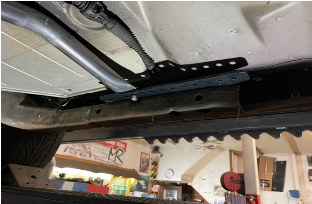
The passenger side bracket bolts to the chassis with the tapered end facing the rear of the car as shown